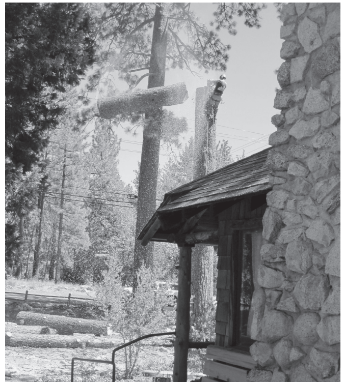
“Timber!” Contractor perched atop dead pine tree in front yard of museum sends part if its trunk crashing to the ground in a cloud of sawdust.