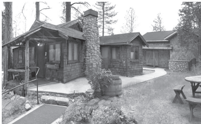
Archive & Research Center (at right) complements the IAHS museum.

Diego Natural History Museum. That last one involves a long-term project with biologists who are repeating a 1908 survey of animal populations in the San Jacintos, to learn what’s changed over the past century. One aspect of the project is pairing early 20 th -century photographs from our collection with the identical scenes shot today, to show changes in the landscape.