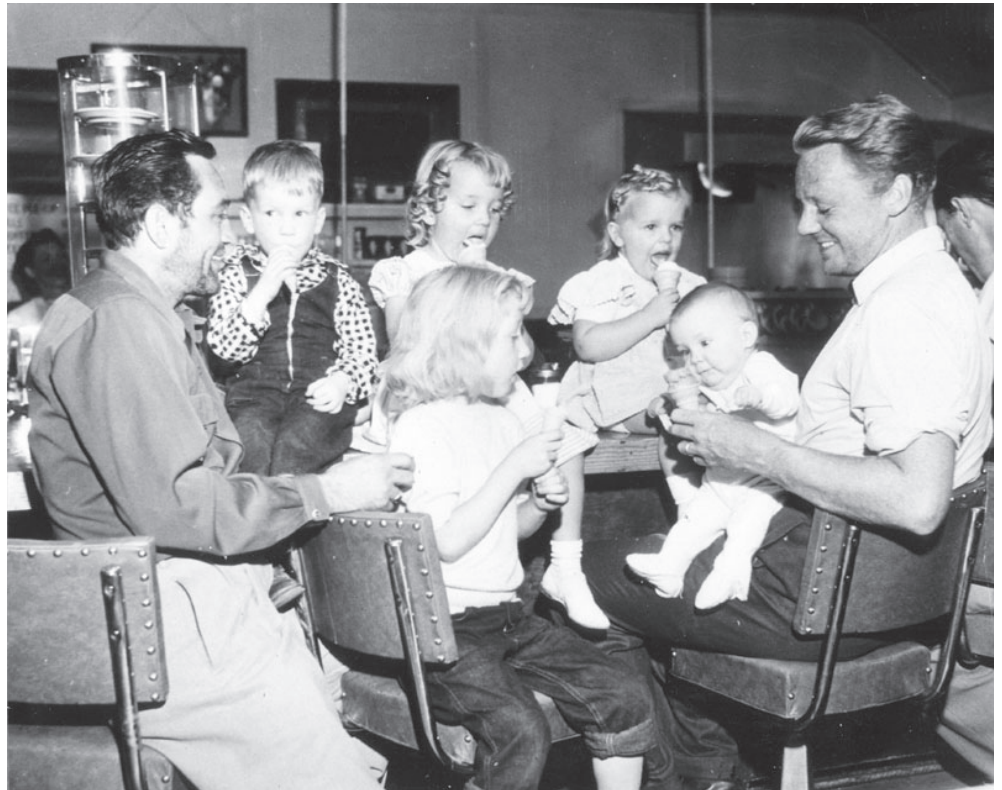
One recent acquisition was this original 1950s photo of movie actor Van Johnson (right) entertaining local children at the Koffee Kup (now the Red Kettle).