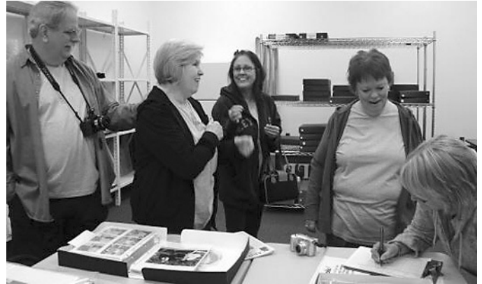
Elvis fans examine the IAHS archive.