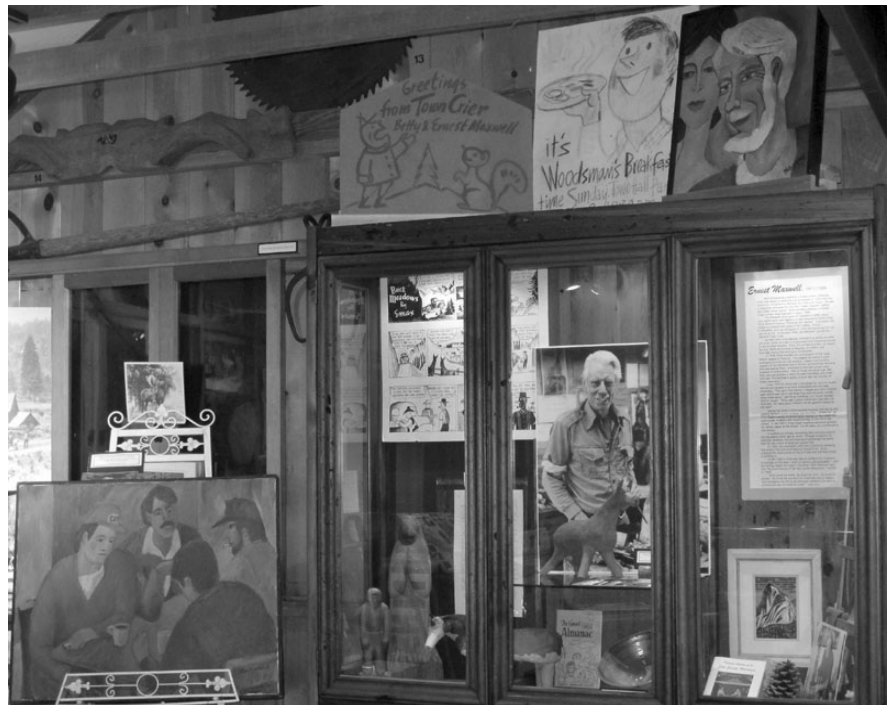
Emax exhibit now on display in IAHS Museum.

. . . An area with so many attractive features can't keep out of the limelight very long. The question is—what are we going to do about it? . . . we don't have to accept the unpleasant features that come with a fast-growing resort, unless by indifference. Nobody benefits from a mushrooming, haphazard development except the fast-moving operator who moves in—exploits, then moves on to the next “killing.” Some of Southern California's finest resort areas have already been devastated by lack of planning. Property values are reduced, trees are cut without thought to future generations, and health and sanitation are allowed to reach a dangerous point. (See page 5)