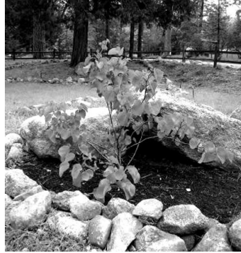
New redbud tree.

Be sure to spend some time in our Community Garden and see more results of the Idyllwild Garden Club's wonderful plantings. New this spring—a small redbud tree planted on Arbor Day.