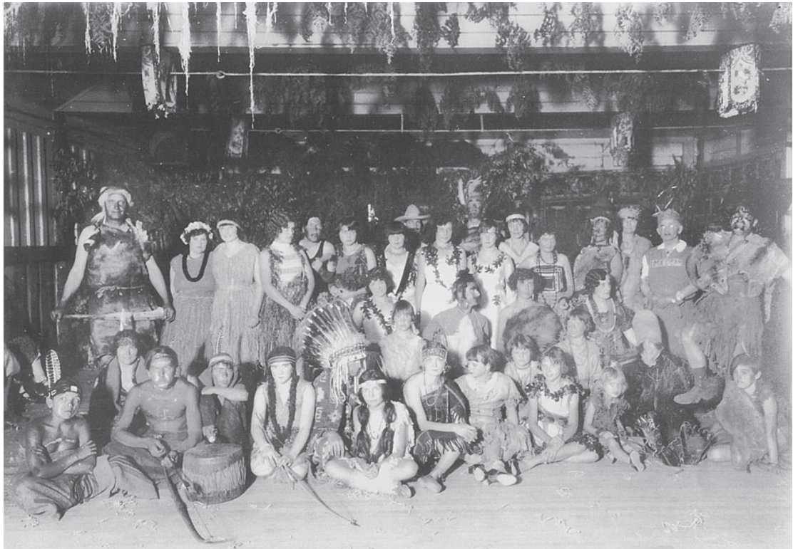
Unmasked vacationers in outlandish garb for a masquerade ball at the Idyllwild Inn.

• FANCY DRESS BALL: A mock marriage ceremony was a special feature of the evening. “The vows, to which the bride and groom were asked to subscribe, were cleverly worded and pronounced in true orthodox style.” Costumes were awarded