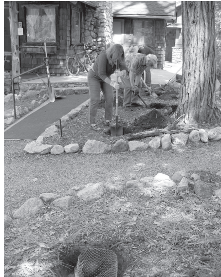
Idyllwild Garden Club volunteers prepare the museum grounds for planting the new heirloom rose garden.