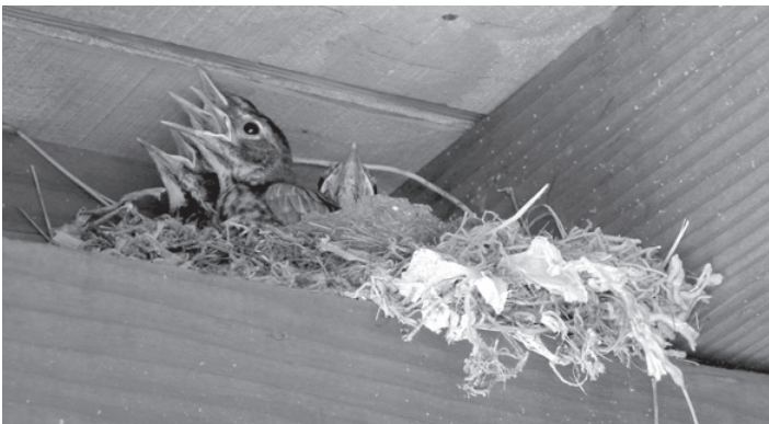
Museum visitors and staff were entertained last month from the rafters of the archive building's porch by our resident robin family.