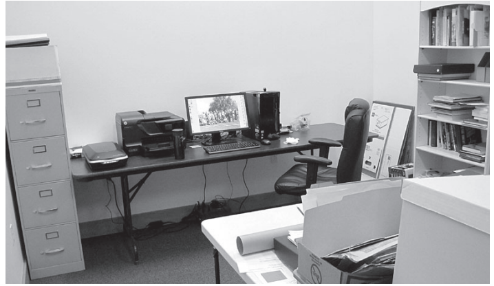
Donated computer is at the heart of newly completed archive work area.

Examples include providing historic photos for the State Park to display in its Visitors Center; for the Forest Service to display at a historic site in the national forest; for the Idyllwild Library's grand opening; and for fire-history research at UC-Riverside. We also provided information for several botanists doing field surveys in our mountains. We worked with Idyllwild Community Recreation Council's