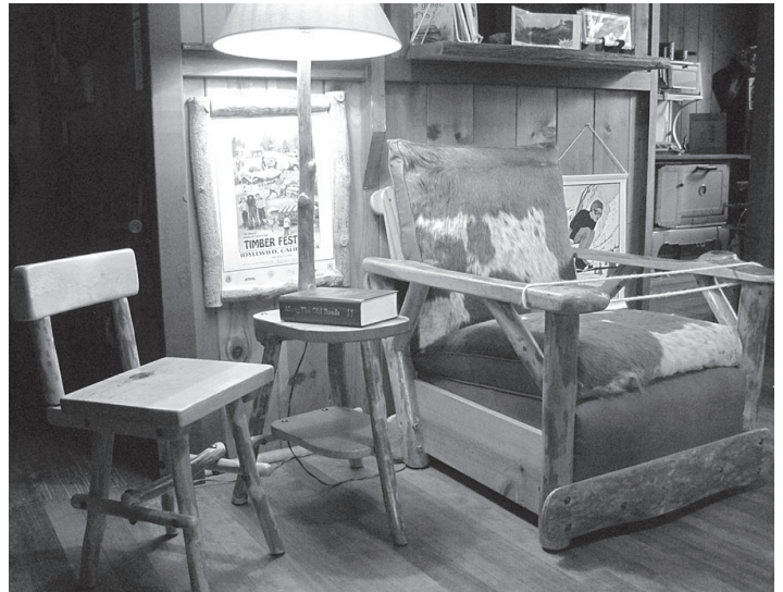
Samples of Pinecraft on permanent display at the IAHS museum.

Selden Belden built and marketed his trademarked craftsman furniture in Idyllwild between (See Pinecraft, next page)