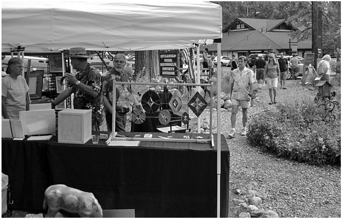
A steady stream of tourgoers passed artists' booths in the Village Garden on their way to refreshments at the museum.