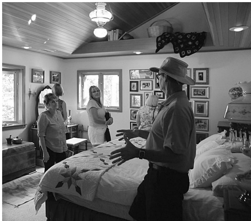
Docent teams pointed out highlights of each home.