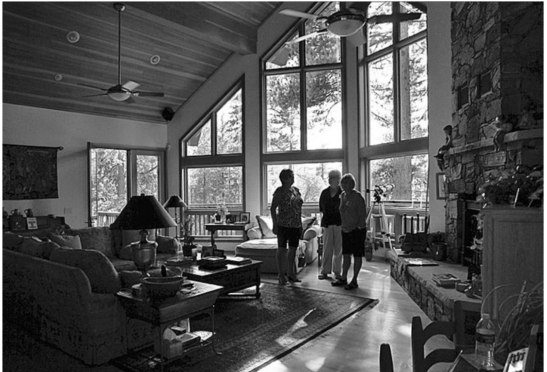
A quiet moment during a lull in the parade of visitors.

The generosity of residents who open their doors to crowds of curious visitors is a basic ingredient