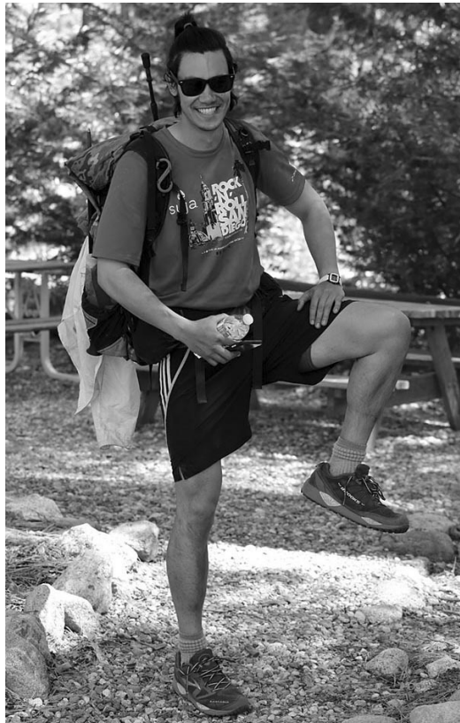
Happy hiker enjoying a “zero” day