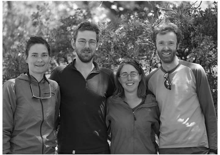
Typical PCT hikers

May 3, 2015: I knew I was good at making friends before but it’s really showing out here on [the]trail and especially in town. After hiking 22 miles on Thursday and 15 on Friday we