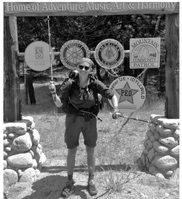
Jolly Pionjar under the "Welcome to Idyllwild" sign on Highway 243

We were in a corner sitting on benches when a women [sic] tied up her dog and went inside. We didn't think much of it until we were leaving and I went to reach for my pack and the dog reached out and bit my left forearm. I couldn't believe it. A dog has never hurt me before....my trail friends around me jumped into action and got me away from the dog, called animal control, calmed me down and helped clean the wound. My historical group lady rushed over and immediately helped as well. She took me to the clinic and got me in right away. I got a tetanus shot and 10 days of antibiotics. The town really set me up and made me feel so much better. We met lots of hikers along the way and many heard about the girl that got bit by a dog. Crazy. . . .